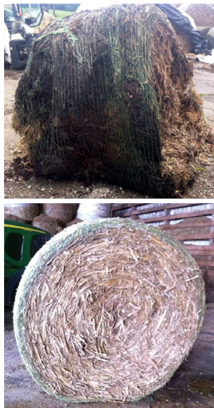
Figure 1. Higher moisture bale (top) and lower moisture bales (bottom) at 360 days.

matter contents were similar over time in storage. Higher moisture bales became very difficult to move after 120 days in storage because they lost structural integrity (Figure 1). Overall, bales with lower moisture performed better regardless of intended use or storage type.