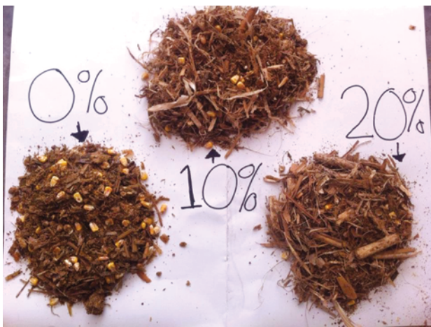
Table 5. Total ration composition for feeding study components (DM %).

The objective of the cattle feeding study was to evaluate the use of stover as an alternative forage. Bales were processed by a bale buster and fed as a percentage of the total mixed ration. One hundred and forty-four Holstein yearling steers (eight head to a pen) averaging 952 lb were fed 0 percent, 10 percent or 20 percent stover on a DM basis, with stover replacing a proportionate amount of corn silage. Nutrient composition and feedstuff composition of the rations are shown in Table 5.