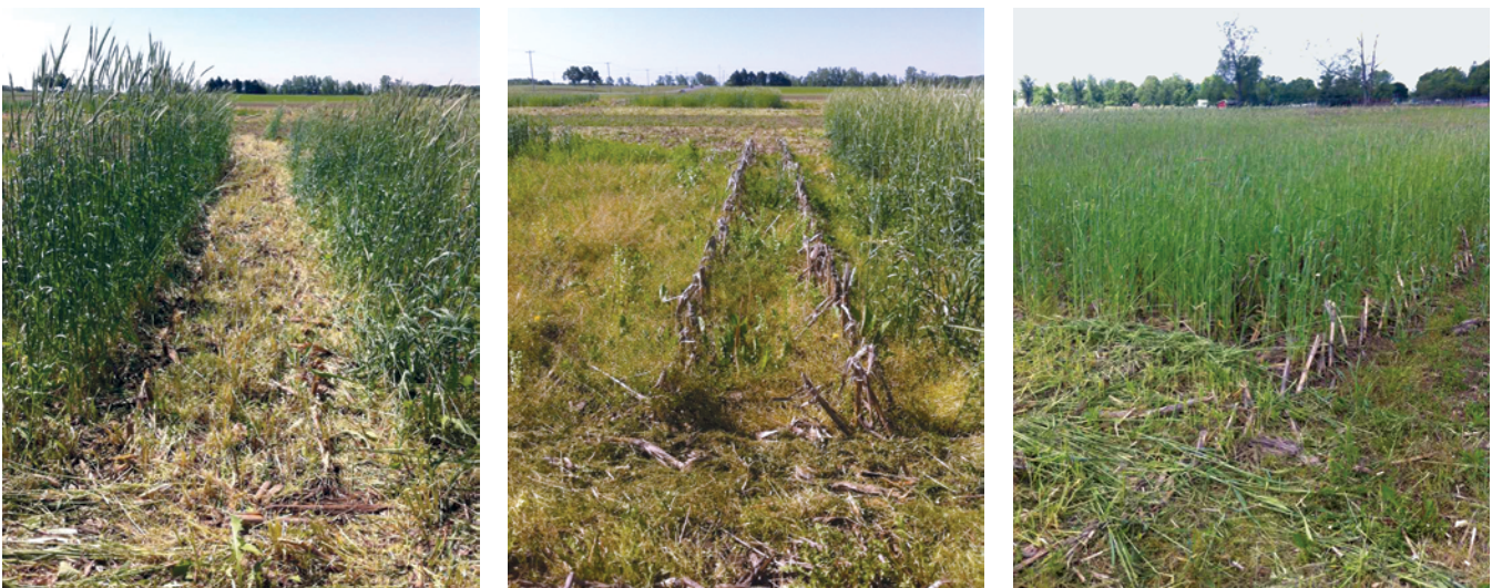
Picture taken at spring harvest time of an interseeded plot with corn stover harvested in the fall, stover-only plot and interseeded plot with corn stover.