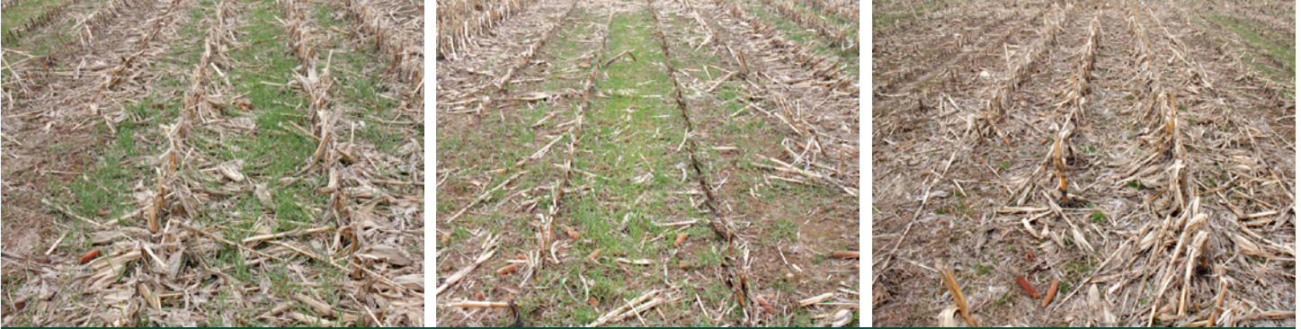
Pictures taken at fall harvest time of an interseeded plot with no harvest, an interseeded plot that was harvested and a stover-only plot that was harvested.

pass outweighed the nutritive advantage, a single corn stover fall harvest would have the greatest yield for ethanol production. If harvesting stover for cattle feed, a single pass harvest in the fall is recommended to avoid yield loss due to overwintering in the field. If harvesting in the spring is planned, a winter annual cover crop should be interseeded in the fall to offset the stover's overwinter decrease in yield, crude protein and digestibility. Although triticale's nutritive concentration was higher, its yield was lower, making the two cover crops we tested equally beneficial for cattle feeding.